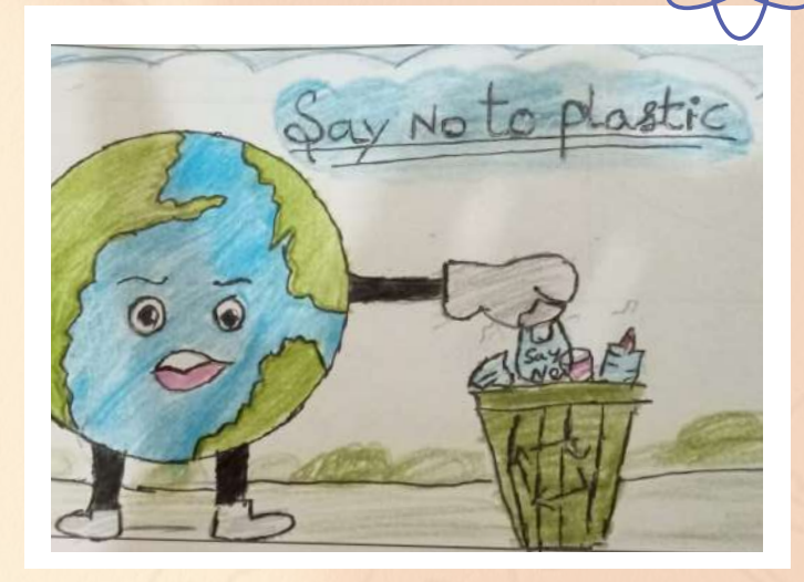
ART BY AARADHYA - GRADE 4